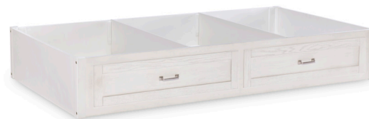
3860-9500 Trundle/Storage Drawer W75 D41.5 H12.5 Takes Standard Twin Mattress (Max Size: 75x39x8) Casters, 2 Removable Dividers for Storage