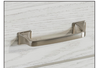
Brushed Nickel Hardware