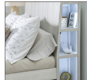
Unique Light-Up Storage Headboard