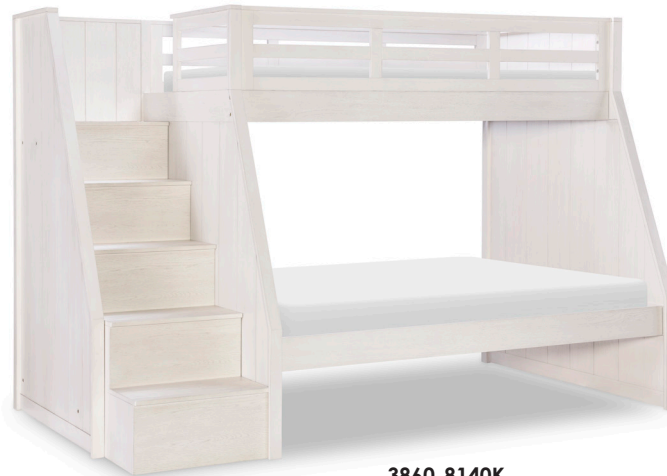
3860-8140K Complete Twin over Full Bunk Bed with Steps W103.5 D57 H71