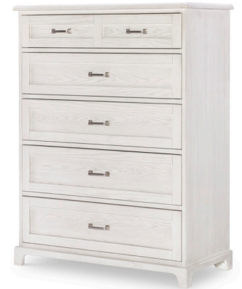
3860-2200 Drawer Chest W38 D18 H50 5 Drawers