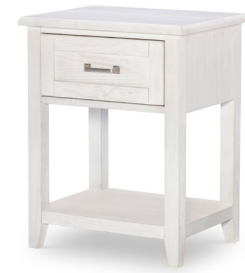
3860-3101 Nightstand W21 D16 H27 1 Drawer, Open Shelf on Bottom