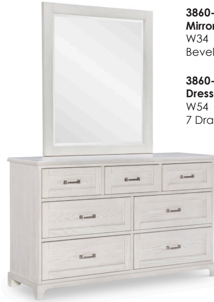
3860-0100 Mirror W34 D1.5 H40 Beveled