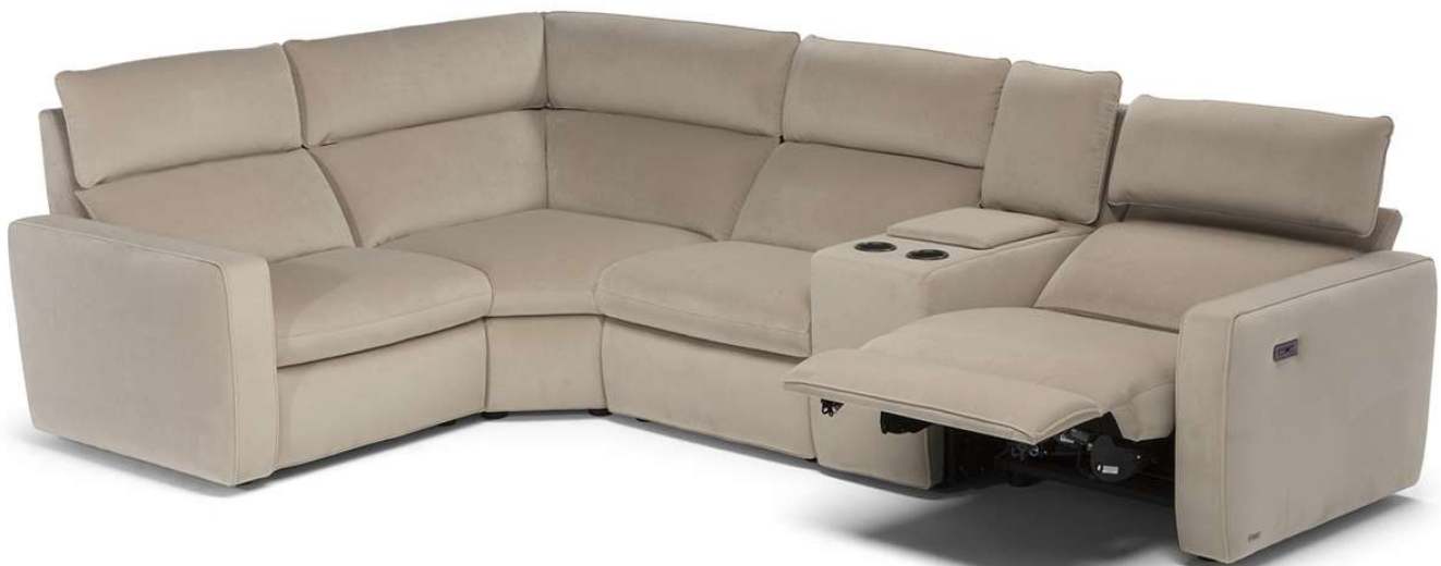
■ Vers. 272+011+291+323+F52