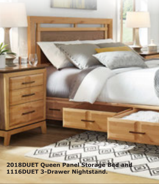
2018DUET Queen Panel Storage Bed and 1116DUET 3-Drawer Nightstand.

Whittier Wood FURNITURE Real Wood. Real Quality.