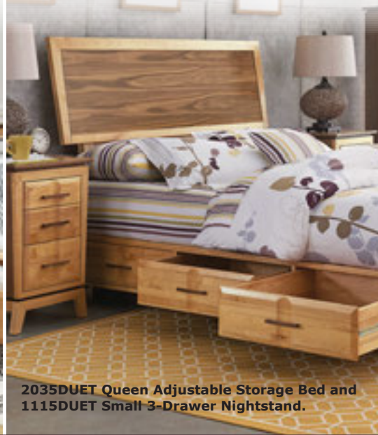
2035DUET Queen Adjustable Storage Bed and 1115DUET Small 3-Drawer Nightstand.