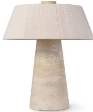
TABLE LAMP INSTALLATION INSTRUCTIONS MAURICE TABLE LAMP 219379

601 PARR BOULEVARD | RICHMOND | CA 94801