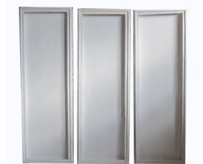
Back view of Wall Decor