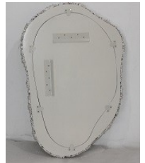
Back view of wall decor