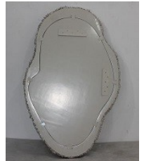
Back view of wall decor