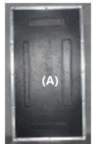
Back view of wall decor