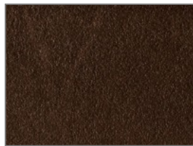
Desert MGP w/ Hammered